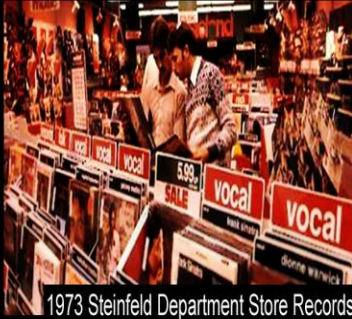
1973 Steinfeld Department Store Records