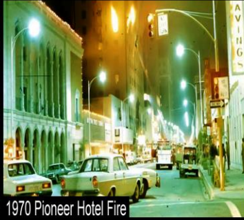
1970 Pioneer Hotel Fire