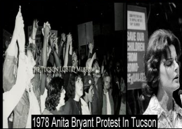
1978 Anita Bryant Protest In Tucson