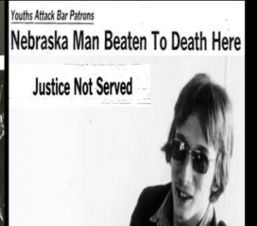
Youths Attack Bar Patrons Nebraska Man Beaten To Death Here