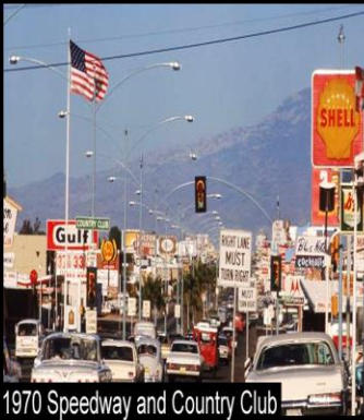
1970 Speedway and Country Club