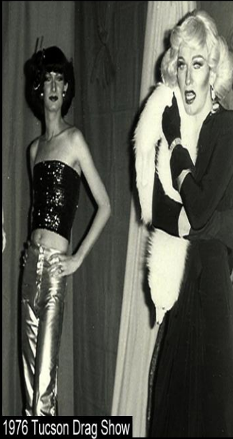
1976 Tucson Drag Show