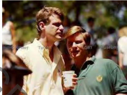
1990's Tucson Pride Event