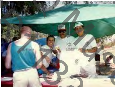
1990's Tucson Pride Festival