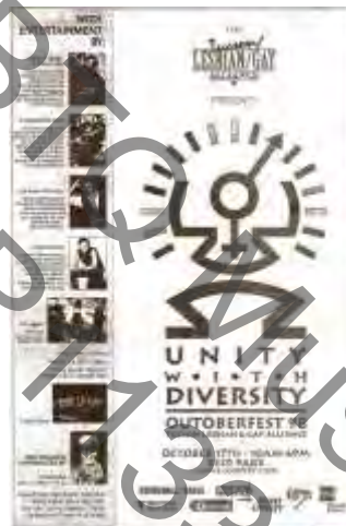
1998 Tucson 'Outoberfest' Pride Festival Poster

The Graduate bar along with its plastic air separation curtain at the entrance affectionately known to some as the "Shower Curtain" at the entrance was gone forever when it closed on Sunday June 6, 1999 after its lease had not been renewed, and held an auction of its memorabilia before being demolished to build an apartment complex development for college students, along with The Rainbow Room bar that had all closed their doors forever. With it, they had all taken their very special unique Tucson atmospheres, their countless hosted Gay Community Events and Fundraisers, and even some of their Colorful Patrons and Employees with them into history. But, in the minds of many who paid their dues back during those times, who had come together so very closely for their common defense against the sometimes Rampant and Violent Homophobia, the memories were etched very deeply forever into their minds.