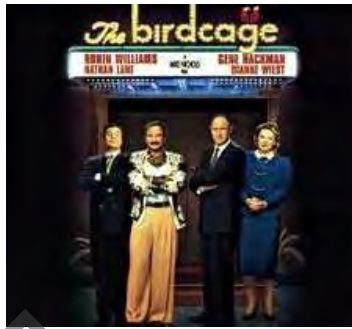
1990's Movie The Birdcage

On April 23, 1990 the Hate Crime Statistics Act was passed by the 101st Congress and was signed into law by then President George H. W. Bush Sr. as the very first federal law to extend federal recognition to Gays and Lesbians. In 1992, Democratic presidential candidate Bill Clinton actively courted the 'Gay Vote' by making campaign promises of increased civil rights for Gays and Lesbians. In Tucson the Tucson Shanti Foundation had a Grand Opening crowd of one hundred ninety four (194) people for previewing its expanded office space on Sunday February 18, 1990, sharing how it operated its free counseling, assistance AIDS / ARC programs, and fundraisers for those of the community suffering from the disease at their 602 N. 4th Avenue location. In the early 1990's historian John Boswell's research revealing that Christian same sex marriages pre-dated heterosexual ones by seven (7) centuries (700 years) became more mainstream.