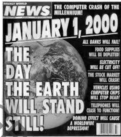
The 1990's Collection (Text Format)

For Tucson, the 1000's millennium was ending, and the new 2000's millennium was soon to be right on everyone's doorstep. Many thought that with the new dependence on computers and those computer systems everywhere in homes, stores, military, stock markets, loan companies, government offices, banks, and other venues that the computers would not switch over to the year 2000 and would leave everything in the world instantly in chaos after midnight in Y2K.