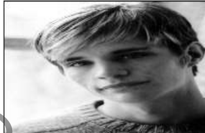
1998 Matthew Shepard Murdered Because He Was Gay