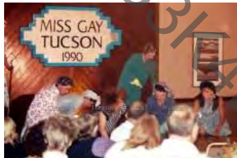
1990 Miss Gay Tucson Pageant