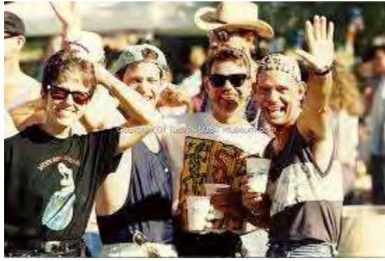
1990's Tucson Pride Festival