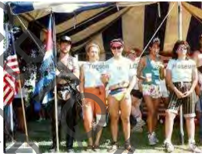
1990's Tucson Pride Festival

MCC Church offered its many gracious services to the LGBTQ community, often sponsoring Bake Sales fundraisers at many of the local bars. The lively Cornerstone Fellowship Church met regularly at 3333 E. Grant Road (later relocating to 2902 N. Geronimo Avenue) finished its Memorial Garden on March 21, 1997 to remember their loved ones and offer an area for memorials, Home Computers started to become more common in the 1990's as BBS (Computer Bulletin Boards) specifically just for the LGBTQ market began starting up along with their ads selling personal computers.