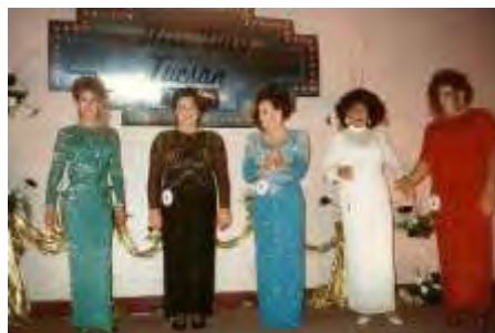
1993-94 Miss Gay Tucson Pageant