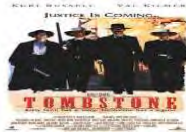
1993 Tombstone Filmed At Old Tucson Studios

By the close of the decade in 1999, Tucson's LGBTQ community would see numerous changes, consolidations, closures, new faces that had moved in from other states, and new startups. The Gay Pride Picnic had become more of a Festival and had been moved from its original place of Himmel Park held in June and changed to a new time and place of October at Gene Reid Park for the cooler weather, larger space & to coincide with National Coming Out Day which had quickly gained in popularity, while the organization and production of the event had been formally taken over by the Tucson Lesbian/Gay Alliance (T.G.L.A.) group. On April 7, 1993 the Tucson Lesbian/Gay Alliance group announced they did not charge for booth spaces but that the City of Tucson and Pima County Government Officials had revised the rules on booths in parks wanting to get their share of the events money and that their fee would be "Minor." The Sunday June 20, 1993 Gay & Lesbian Pride Picnic XVI (16) held at the N/E corner of Himmel Park was highly successful, despite the last minute attempts by the Tucson Police Department & The Arizona State Liquor Board (and whatever groups or individuals who had convinced them to do so) to deny the permit to hold the event there in the park that day just before the event was scheduled to open.