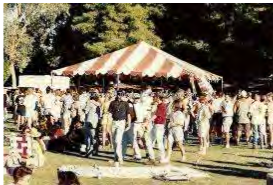
1990's Tucson Pride Festival