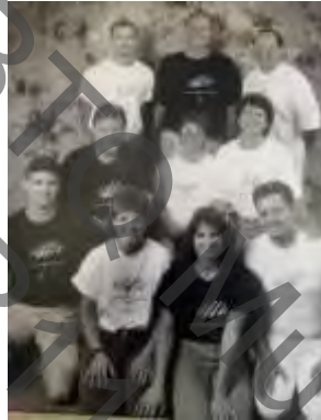
1996 Tucson Pride Festival Board Of Directors

The Information Age of the 1990's in Tucson had opened up with a population of 402,155 living within its then 157.5 square mile city boundaries making it the thirty third (33 rd ) largest city in the United States at the time, and by midnight December 31, 1999 had reached 475,451 people within the expanded 194.3 square mile Tucson city limits from annexation of additional Pima County land areas.