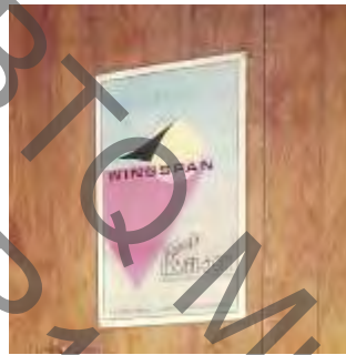
1990 Christmas At The Graduate Bar In Tucson, Arizona

However, it was no longer 1977 (see 1970's) as each new year seemed to bring new added Government & Parks Department Regulations as well as new increased Fees while at the same time there was always new excitement, new faces, new events, new shows, and new experiences as an ever growing and ever changing Tucson LGBTQ Community as thousands moved into Tucson and the world marched into the future. New ideas for events, and fundraisers were held as what had once been a one day Pride Picnic evolved into more than a week of activities including for the first time including the immensely popular 'Gay West' Pride Week Fundraising Event held out at Old Tucson Studios for the first time on Saturday June 26, 1997 beginning at 6:00PM.