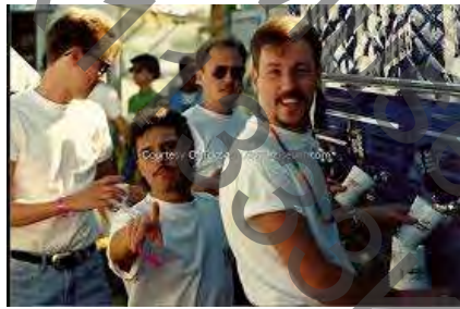
1990's Free Beer At Tucson Pride Festival Local Bartenders Serving With Beer Provided by Tucson Gay Bars