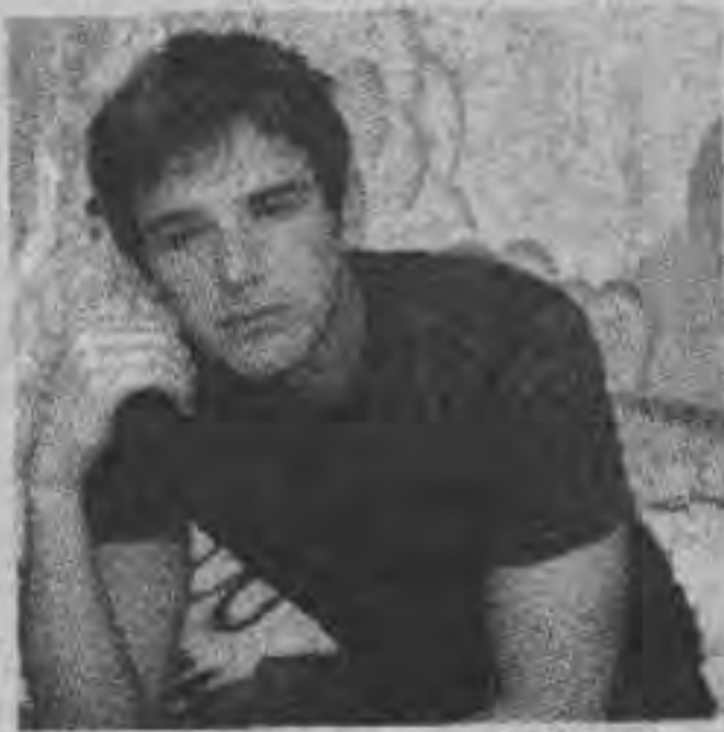
Brent Corrigan/Sean Lockhart