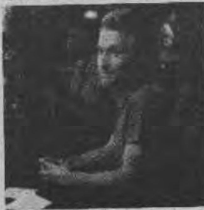
Scene from: Hunting Season