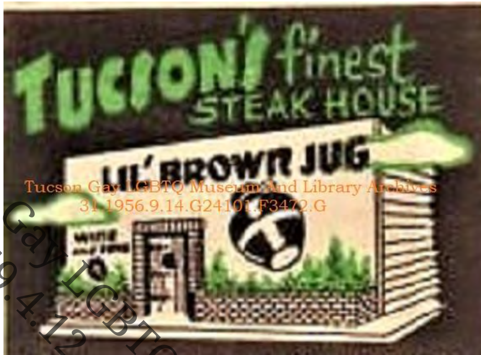
1956 A Straight Cocktail Lounge And Steak House Afternoons And Evenings. Then, A Swinging Gay Bar All Night Long.

At the same time, the Lil Brown Jug was vigorously being advertised in the 'underground *homosexual publications' all around the United States and drew also a nationwide *'homosexual tourism appeal' for a number of its early years as many from around the United States made their own *Homosexual Pilgrimage just to visit and experience the Lil brown Jug lounge.