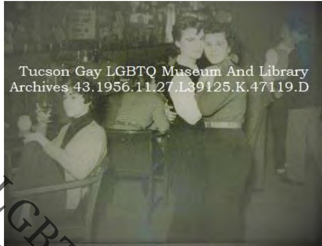
Tucson Gay LGBTQ Museum And Library Archives 43.1956.11.27.L39125.K.47119.D