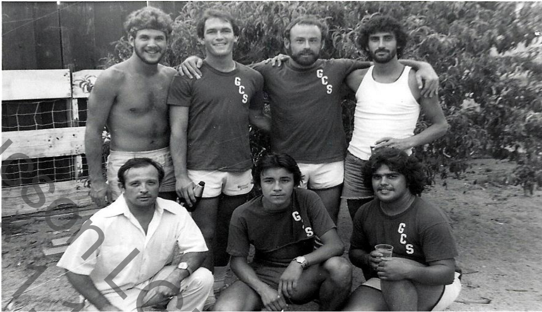
1977 - Tucson Gay Community Services Center Volunteers

The official Housewarming Party at the new location was held starting at noon on Saturday January 15, 1977 as a BYOB (Bottles, Butts, Boys, Beer) event that was heavily attended by the Tucson Gay Community. To raise funds for operating their programs regularly scheduled Flea Markets were held in the parking lot and other Gay Friendly venues around Tucson.