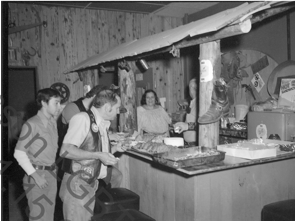
1978 – Tucson Gay Community Services Center Bake Sale Fundraiser Held At Tramp's Bar At 616 N. 4th Avenue, Tucson, Arizona

The Gay Community Services Center also regularly combined efforts with the Tucson Metropolitan Community Church and often at times all the local Gay Bars in organizing food drives for items to be given to the Tucson Food Bank which at that time was distributed only to local agencies such as the Tucson Gay Community Services Center for re-distribution to their own clients.