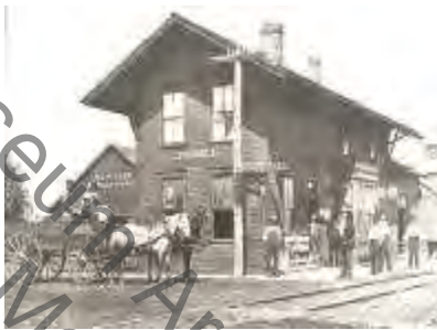
1874 Goodell, Iowa – Train Station

Time was often spent playing with my sisters Barbie's. What FABULOUS little boy didn't? I would tie the Barbie's in the back of my trucks and strap the truck to the back of my bike. Then, I would DRAG that girl around with me for hours riding through mud puddles and trash piles. She would get so dirty, she would take her bath with me after supper.